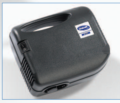
Convenient carrying handle for ease of transportation.